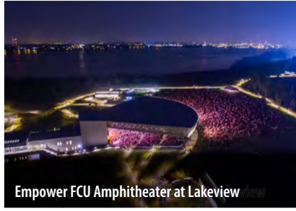
Empower FCU Amphitheater at Lakeview