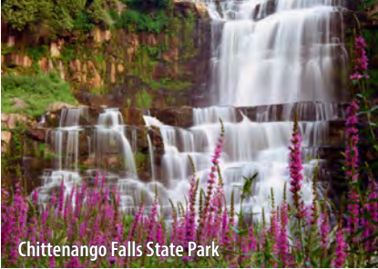
Chittenango Falls State Park

From tech, the arts, cultural events, and beautiful natural surroundings to sports and seasonal outdoor activities, Onondaga County is a great place to live, work, play, and raise a family.