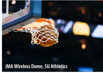
JMA Wireless Dome, SU Athletics