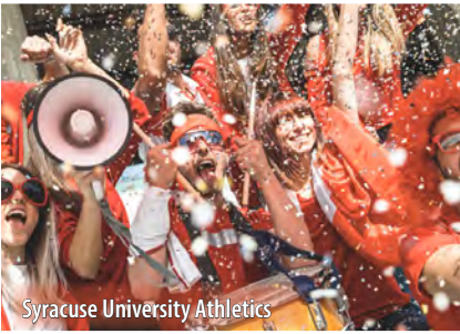
Syracuse University Athletics