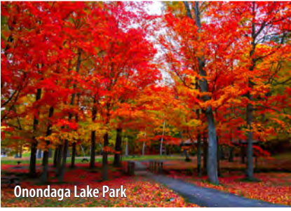
Onondaga Lake Park