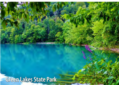
Green Lakes State Park