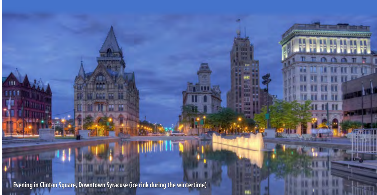
Evening in Clinton Square, Downtown Syracuse (ice rink during the wintertime)