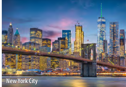
New York City