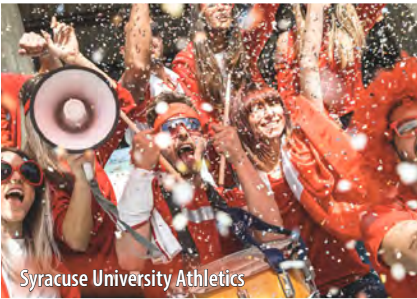
Syracuse University Athletics