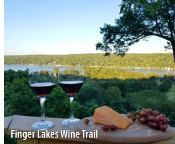
Finger Lakes Wine Trail