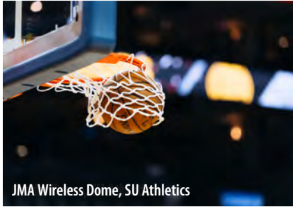
JMA Wireless Dome, SU Athletics