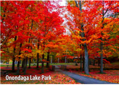
Onondaga Lake Park