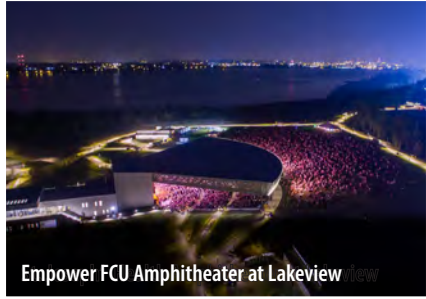
Empower FCU Amphitheater at Lakeview