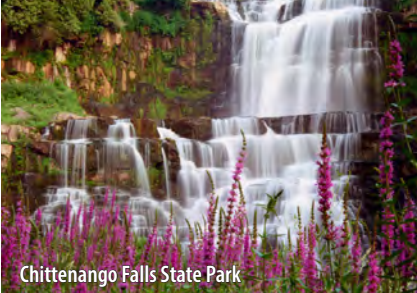
Chittenango Falls State Park

From tech, the arts, cultural events, and beautiful natural surroundings to sports and seasonal outdoor activities, Onondaga County is a great place to live, work, play, and raise a family.