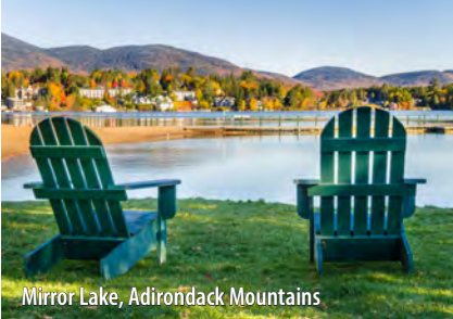
Mirror Lake, Adirondack Mountains